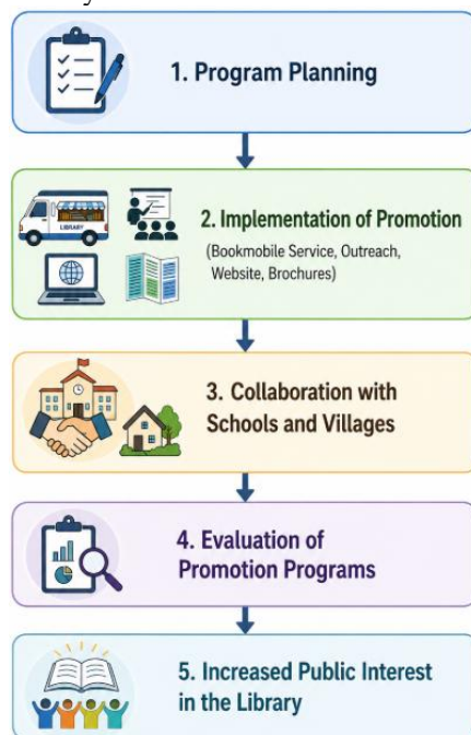
Figure 1. Library Promotion Communication Strategy Flow

The results of this study align with several previous studies that suggest that promotional strategies play a significant role in increasing public interest in visiting libraries. Previous research has demonstrated that the use of effective communication media and services can help build a positive image of libraries within the community [35]. Furthermore, actively conducting promotional activities can also increase public participation in utilizing library services. These findings reinforce the view that promotional communication strategies serve not only as a medium for disseminating information but also as a means of building relationships between