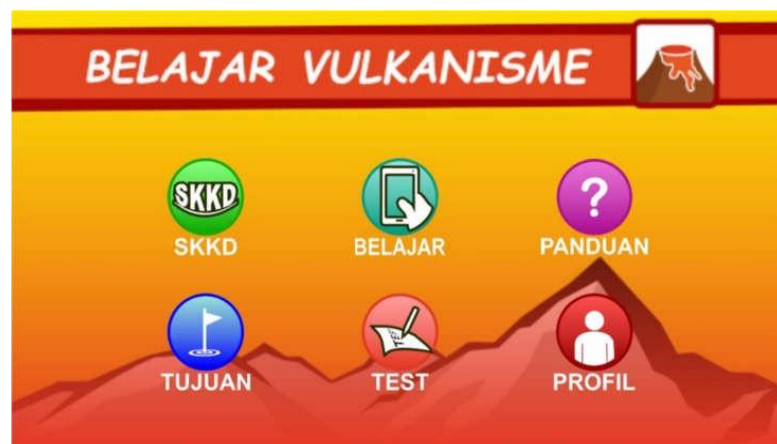
Figure 2. Main Menu Page