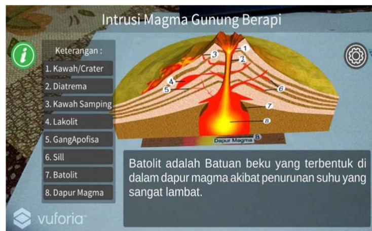
Figure 1. Intrusion AR Page View

This research produces a product in the form of Augmented Reality-based learning multimedia for volcanism material on the Android platform [24]. The product was developed using Unity 3D 2018.4.4f1 software with Vuforia SDK for AR technology implementation, and Blender 2.79b for three-dimensional object creation. This multimedia has six main menus, namely the SKKD, Objectives, Learning, Test, Guide, and Profile menus [25]. In the Learning menu, there are five sub-materials, each equipped with an AR page to display 3D objects or explanatory videos, such as volcano cross-sections, magma intrusions, magma extrusions, volcanic morphology, and eruption types [26]. Product functionality testing using the black box testing method shows that all available navigation buttons and features have functioned well as expected.