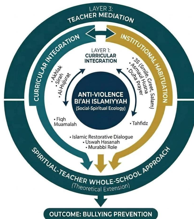
Figure 2. Three-layer -based anti-bullying implementation model within anti-violence bi'ah Islamiyyah

This model constitutes an original theoretical contribution in the form of a formally articulable conceptual proposition: