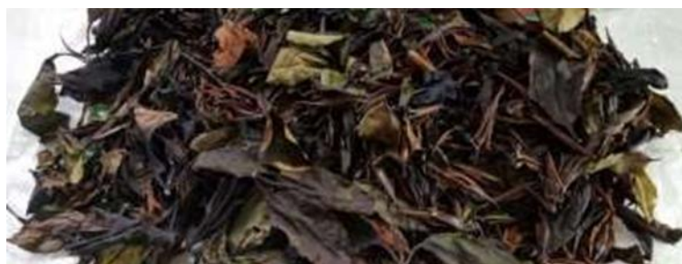
Figure 1. Drying process of Rhizophora mucronata leaves prior to extraction

A total of 4.5 kg of Rhizophora mucronata leaves were air-dried at room temperature until reaching a low moisture content, then blended into powder. The drying process of mangrove leaves is illustrated in Figure 1.