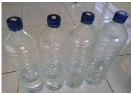
Figure 4. Ethanolic extract solutions of Rhizophora mucronata leaves at different concentrations (12.5, 25, 37.5, and 50 ppm).

In addition, the ethanolic extract was diluted into several concentrations (12.5, 25, 37.5, and 50 ppm) to be applied to the milkfish samples during preservation. Each concentration showed different color intensities corresponding to the concentration of bioactive compounds. The appearance of the diluted ethanolic extract solutions is presented in Figure 4.