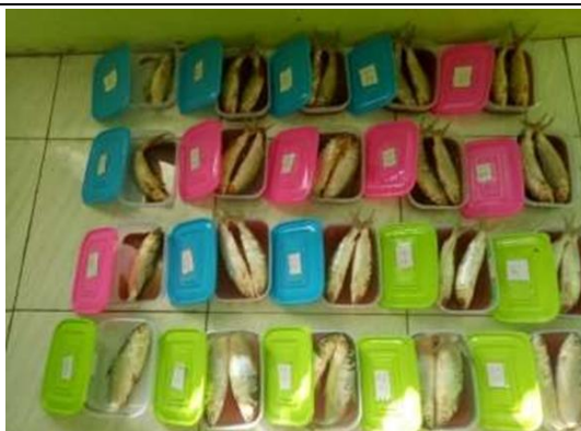
Figure 2. Preservation of milkfish ( Chanos chanos ) using ethanolic extract of Rhizophora mucronata leaves at different concentrations (12.5, 25, 37.5, and 50 ppm).