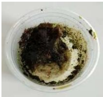
Figure 3. Ethanolic extract of Rhizophora mucronata leaves used as treatment in the preservation of milkfish ( Chanos chanos ).

In addition, the ethanolic extract was diluted into several concentrations (12.5, 25, 37.5, and 50 ppm) to be applied to the milkfish samples during preservation. Each concentration showed different color intensities corresponding to the concentration of bioactive compounds. The appearance of the diluted ethanolic extract solutions is presented in Figure 4.