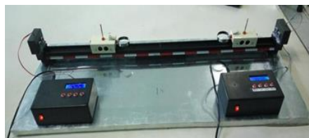
Figure 1. A series of practical equipment for linear momentum collisions

The product prototype in the form of a linear momentum collision practical tool with a microcontroller can be seen in the picture below: