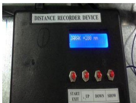
Figure 2. Layout of an object speed measuring device

The product resulting from this research and development is a linear momentum collision practical tool with a microcontroller. This practical tool aims to calculate the amount of momentum before and after the collision. The product in the form of a tool for determining the speed of objects can be seen in Figure 2 dan figure 3. The series of linear momentum collision practical tools resulting from the overall development can be seen in the figure below.