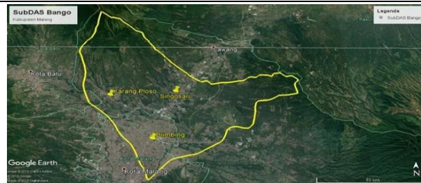
Figure 5. Bango Sub-DAS Slope Map

This map highlights that areas with slopes greater than 40% are concentrated in specific zones and represent the highest potential for landslides. The visualization helps to identify locations where mitigation measures and careful land management are most needed.